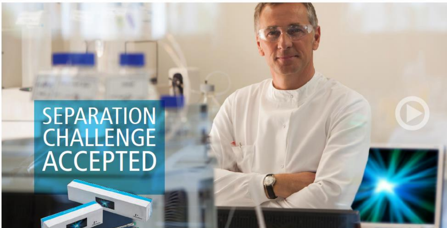
Quasar™ Liquid Chromatography Columns